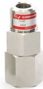
Check valve CH-01