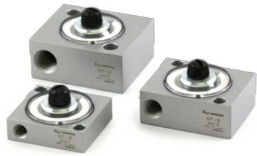
Vacuum filter VF series