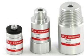
Work drop prevention check valve FPV series