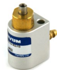
Barb connectot type TKY series