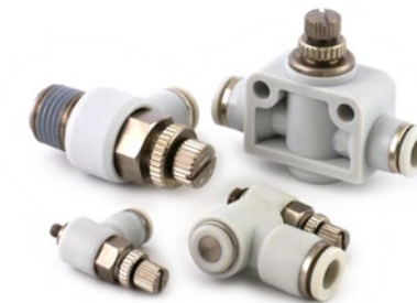
Speed controller line-up