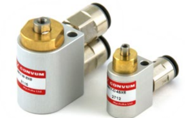
Push-in connector type MKY series