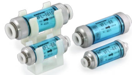
Vacuum in-line filter VFL series