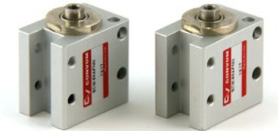
Block type SCW series