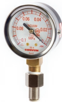
Vacuum gauge SG-4