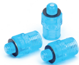
Miniature vacuum in-line filter VFL-M5