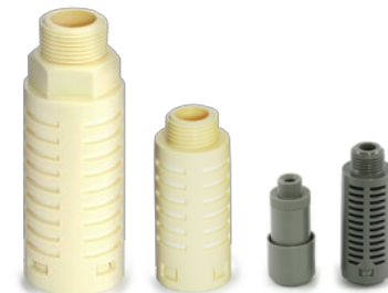
Silencer for CONVUM MS series